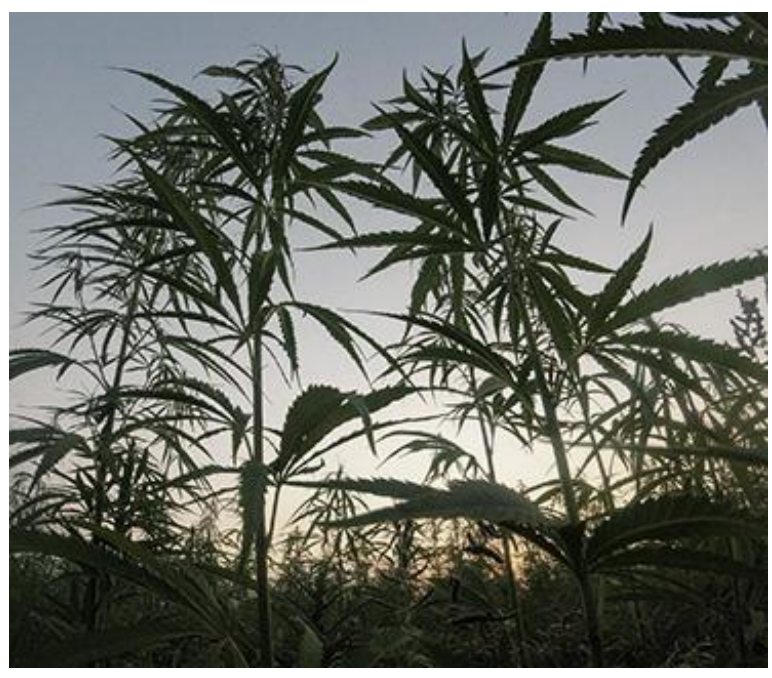
How to export medical cannabis

In order to distribute cannabis primary products that are cultivated and manufactured in Denmark, the product must be admitted to the Danish Medicines Agency's list of cannabis intermediate products and cannabis primary products. However, it should be noted that cannabis intermediate products are distributable, as long as they comply with the Danish Medicines Act and the stipulations established in accordance with the executive order on euphoriant substances. The manufacturer of cannabis intermediate products can only distribute cannabis intermediate products to pharmacies, hospital pharmacies, and manufacturers with a license to distribute drugs. In addition, cannabis intermediate products are not allowed to be distributed to manufacturers and persons outside of Denmark.